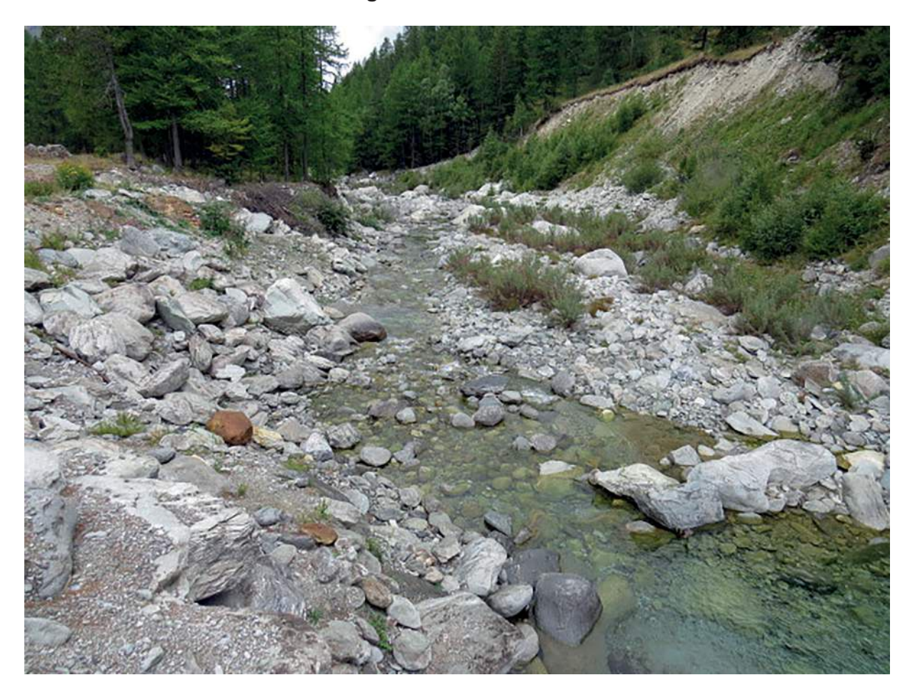
Fig. 3.1 for Question 3